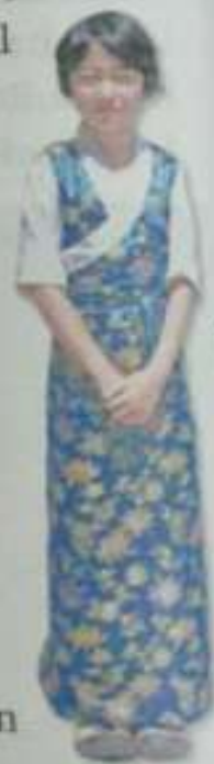
A Sikkimese girl dressed in bakhu

Sikkim is famous for oranges, cardamom and orchids. Some men and women wear a loose gown, fastened at the waist. It is called bakhu. They also wear colourful jewellery made from beads. The main tourist places are Gangtok and Pelling.