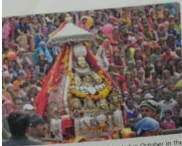
Kullu Dussehra is celebrated in October in the Kullu valley of Himachal Pradesh.