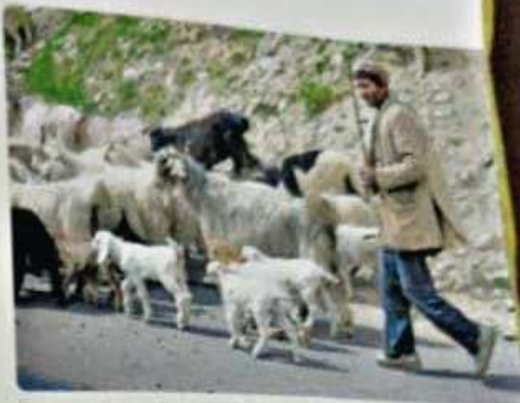
The availability of pastures has made sheep rearing an important occupation in the mountains.

Jammu & Kashmir and Ladakh lie in the Himalayas and the Karakoram Range. Himachal Pradesh, Uttarakhand, Sikkim, Darjeeling in West Bengal and some part of Arunachal Pradesh are in